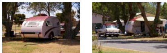
.An older car & caravan at the Park for the weekend.

Sun 9th December 2007: Sunday was almost a repeat of Saturday although Malcolm and I headed down to the wharf a little earlier only to catch one more crab than the previous day while almost being blown off of the wharf at times with the strong wind that was blowing. The day before we were looking for shade to shelter from the sun while today we were laying on the jetty to collect warmth from the jetty timber. Once again it was crabs on the menu for our evening meals. It is nice to be able to catch enough sea food to enjoy without wasting any of it through over catching.