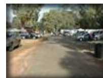
Melrose Main Street. One of the two Hotels at Melrose. Melrose Caravan Park.

SAT 11th JUNE 2005: Other than a quick shower early on Saturday, the weather was now on the improve for the remainder of the weekend. We went for a quick drive to Wilmington and ventured up to Hancock's Lookout where we found the view spoiled by so much haze.