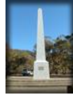
The Monument behind the Caravan Park

Sunday evening saw us eating bananas which had been wrapped in foil and cooked in the hot coals after having chocolate chips placed in under the skins of the bananas. This was something that had been passed onto us by Andrew who was on the site along side of us. What a treat it turned out to be eating hot banana covered in melted chocolate and a dollop of cream.